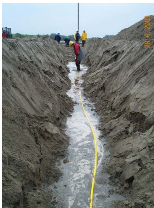
Fig. 2: Simple laying of the horizontal profiles measurement

The system test-pipes are delivered pre-assembled and they can be mislaid freely along the monitored profile (Fig. 2). The direct covering should be carried out with stone-free material.